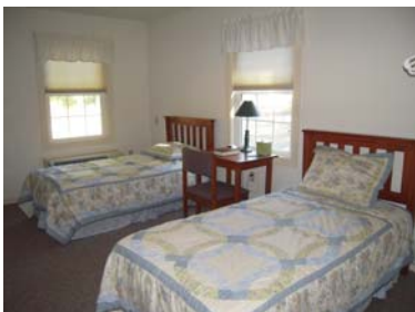
New quilts brighten the guest rooms.

There is new furniture in the meeting areas of the lodges and in the gathering room in the farmhouse. The electrical system in the farmhouse was upgraded. New quilts and valances have brightened the guest rooms.