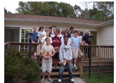
The group from St. Paul's strikes a pose after mass.

We returned from this trip more familiar with each other, and our confirmation class' mission, and restored by a feeling of community and intimacy. Shalom House was the ideal place in which to create a good foundation for our future confirmation classes. Thank you!