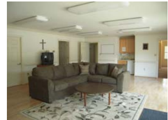
There is new furniture in the meeting space in Deep Woods Lodge.

If you haven't been to Shalom House for a while, we encourage you to stop by for a visit or to schedule a retreat!