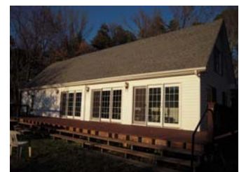
The decks and porches have been stained.

We have been blessed to be able to make many changes at Shalom House!