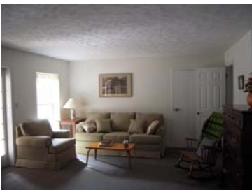
The gathering room in the farmhouse has a new look.

We have a beautiful new logo and brochure. You can find our website at: www.shalomhouseretreatcenter.com .